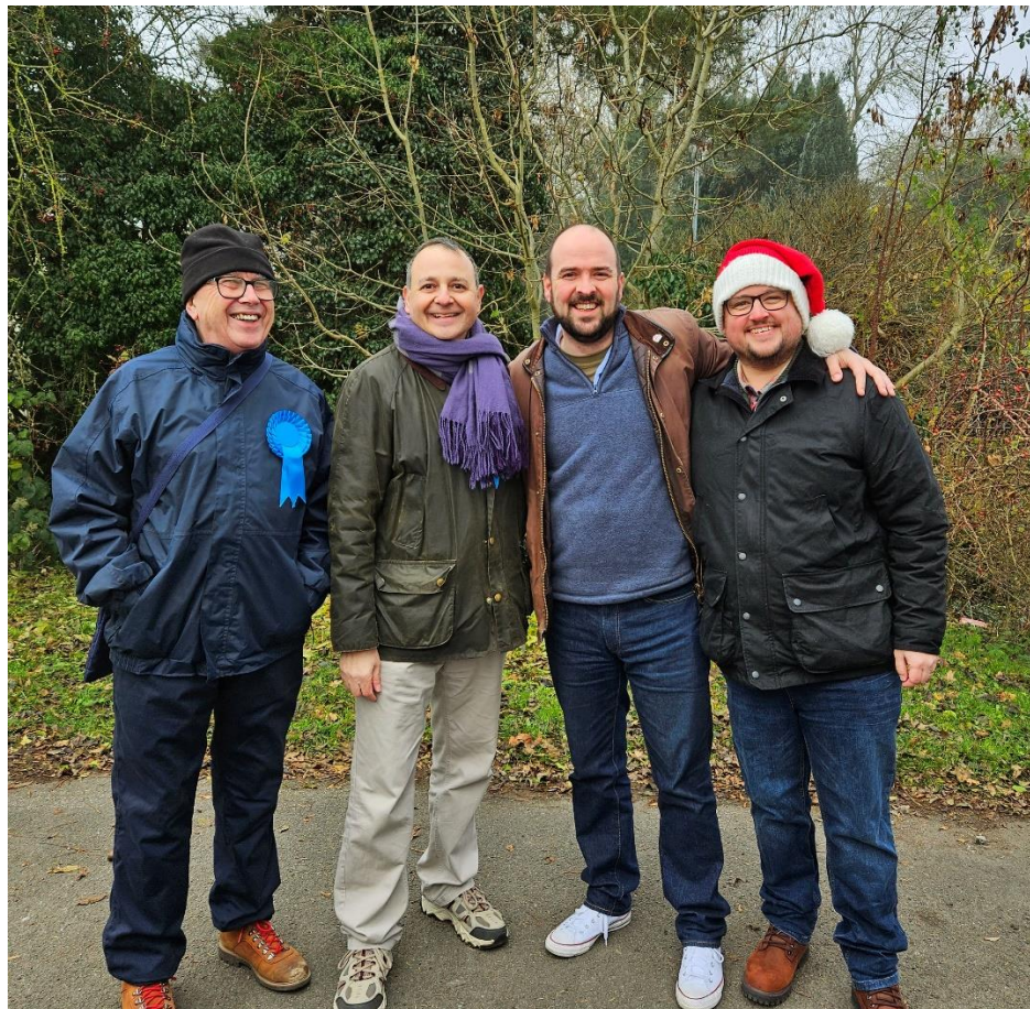
In the photo above we have been out campaigning with our MP and party chairman

Merry Christmas to everyone within Fosse Highcross.